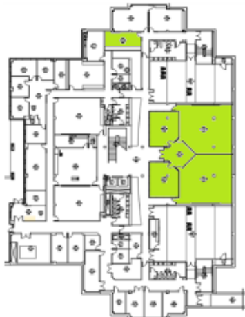
COLLEGE OF EDUCATION LOWER LEVEL