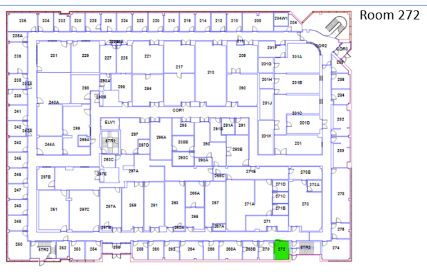
Cameron 2<sup>nd</sup> Floor