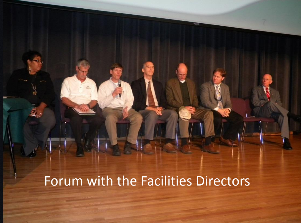
Forum with the Facilities Directors